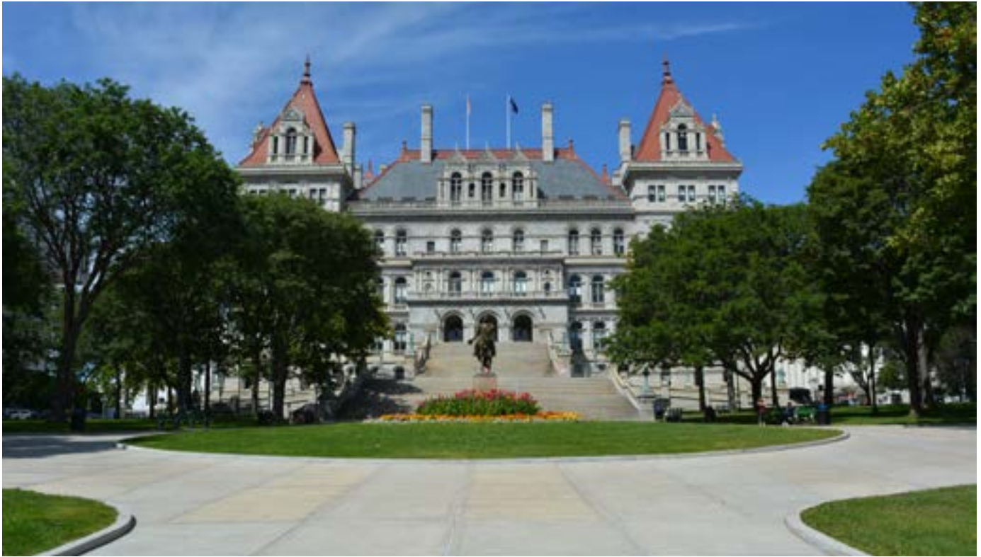
The New York State Capitol building in Albany, New York